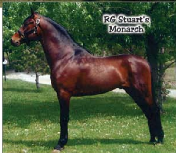
RG Stuart's Monarch