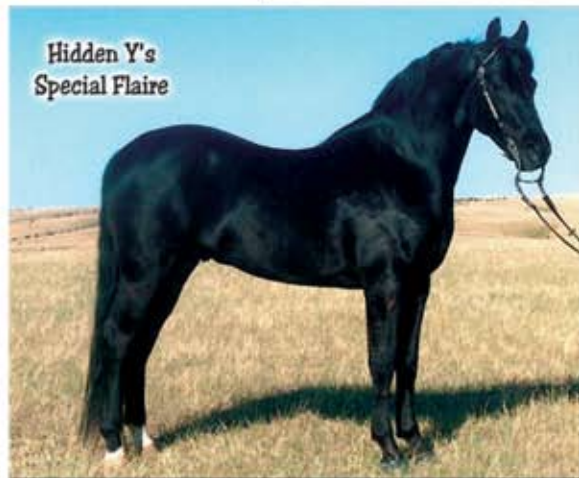
Hidden Y's Special Flaire

Nestled in the hills among the cedar trees in southwest Nebraska, you will find mares and foals peacefully grazing. This is the home of the band of horses of Grunden Ranch Morgans. These horses have roamed the hills since 1969 when the first Morgan set hoof on our place. We are the third generation of Grundens to live here on the ranch which was started in 1935.